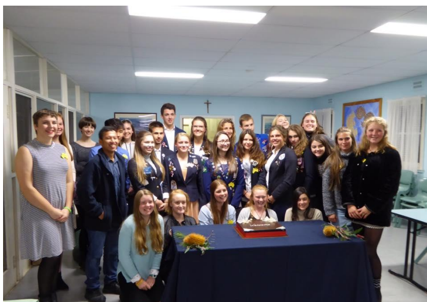
Outbound and Inbound students at Tuross Head